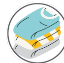
Cloths, Apparel & Uniforms