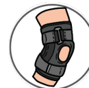
Physical Therapy Devices