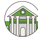
Colleges & Universities