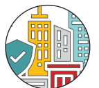
Public Safety & Military