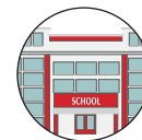
Child Care & Schools