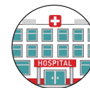
Healthcare & Assisted Living