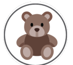
Toys, Games, & Stuffed Animals