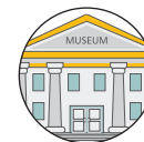
Museums & Galleries